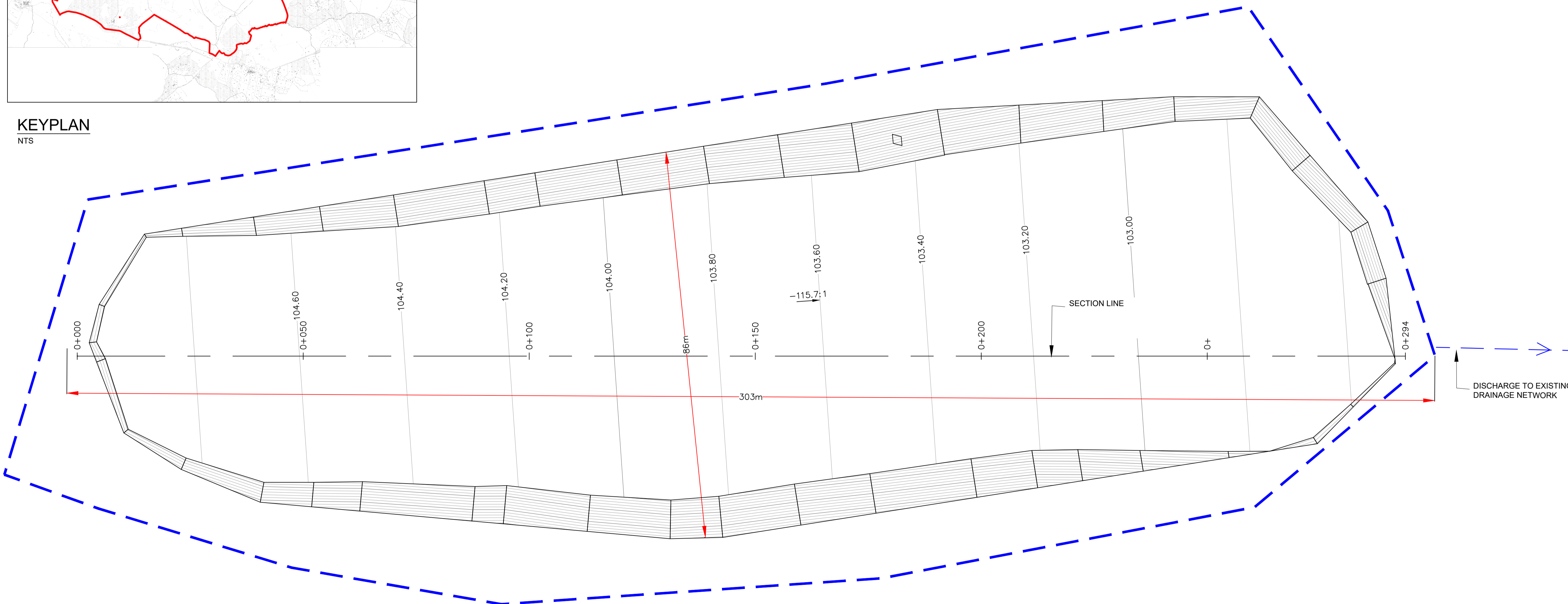
PLAN ON BORROW PIT Scale 1:500